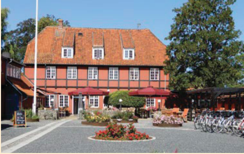
Hotel Ærøhus | Ærøskøbing