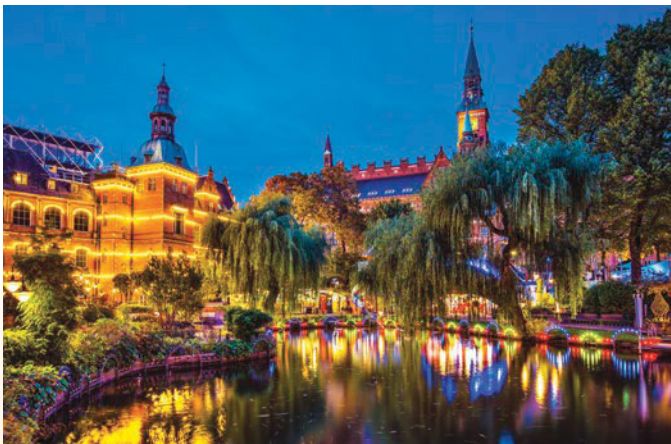
Tivoli Gardens, Copenhagen