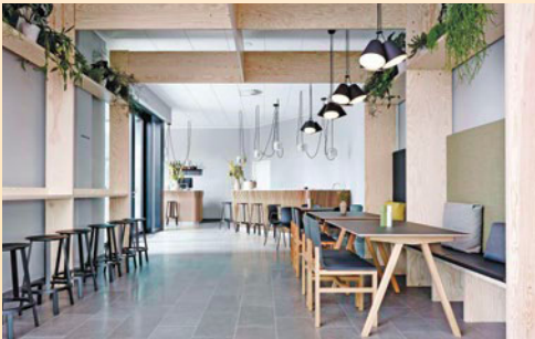
Comwell Aarhus — Dolce by Wyndham | Aarhus