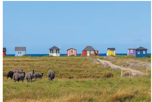
The shoreline of Vesterstrand Beach on Ærø Island is dotted with charming, traditional beach huts, treasured properties that are often handed down from generation to generation.

Silkeborg. Take a guided walk in this vibrant town nestled in Denmark's lush Lake District, and visit the Silkeborg Museum, notable for the remarkably well-preserved Tollund Man and Elling Woman from the fifth century B.C. Savor smørrebrød, traditional Danish open-faced sandwiches, for lunch at a restaurant.