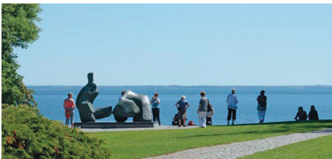
Sculpture Park, Louisiana Museum of Modern Art