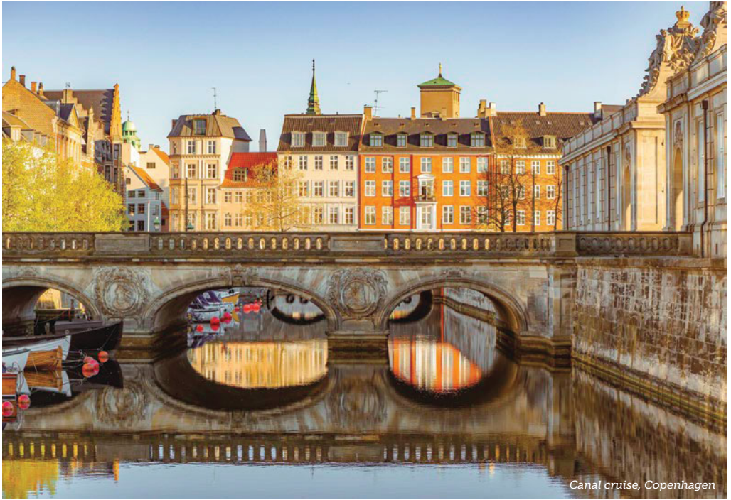
Canal cruise, Copenhagen