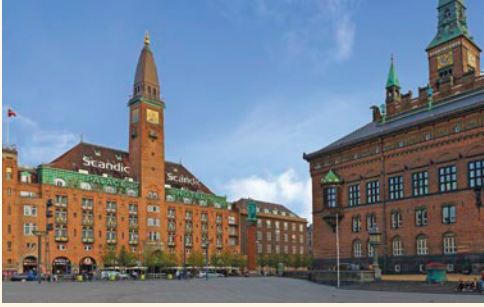
Scandic Palace Hotel | Copenhagen