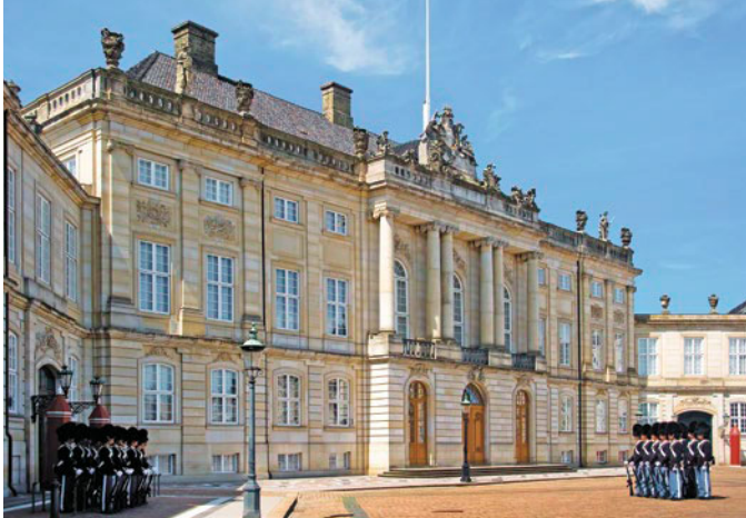
Amalienborg Palace, Copenhagen