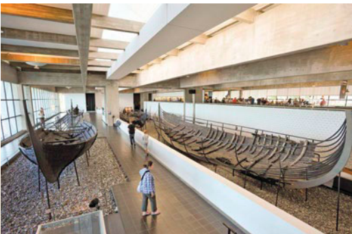
Viking Ship Museum

Travel to Aarhus and check in to your hotel.