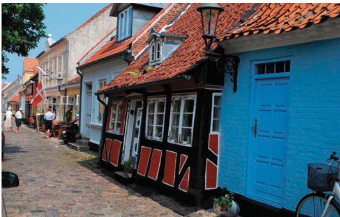
Historic houses of Ærøskøbing