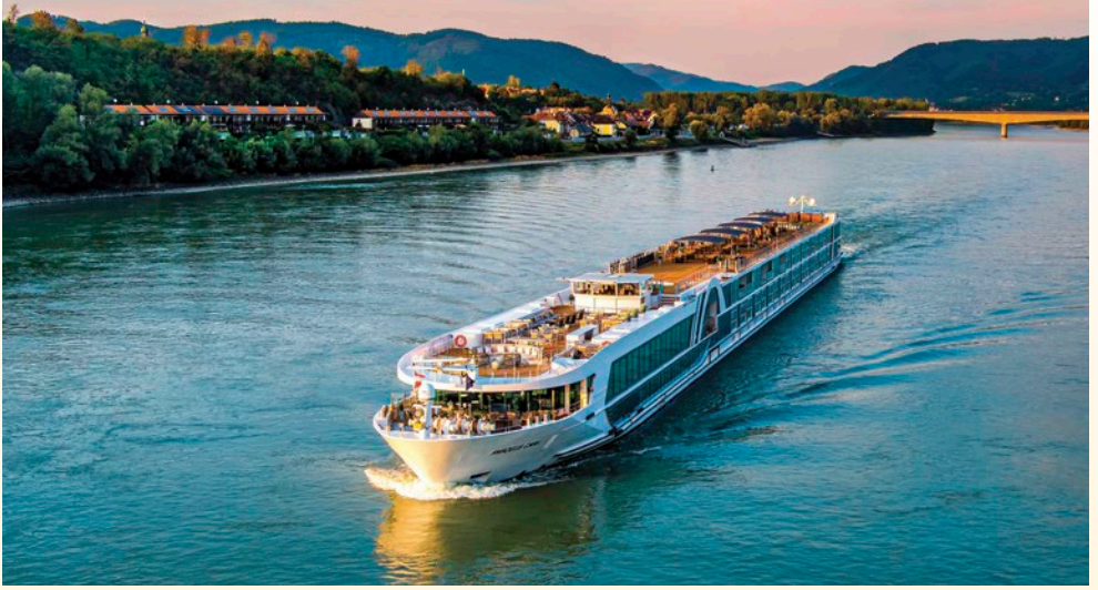
MS Amadeus Cara