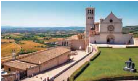
Basilica of San Francesco, Assisi