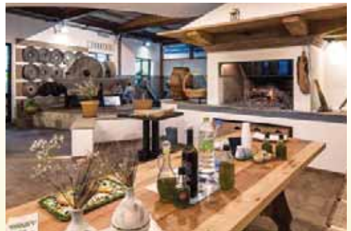
Oleoteca Bartolomei Olive Mill

A Day in Tuscany. Begin in the Etruscan city of Cortona, taking a guided walk past historic palazzos and charming piazzas. Step inside the 11th-century Cortona Cathedral, stop for