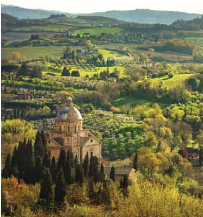
Tuscan landscape near Montepulciano