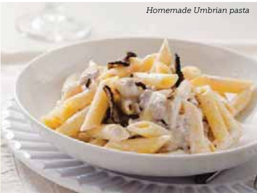
Homemade Umbrian pasta

Free Time: The remainder of the day is at your leisure. Perhaps browse local boutiques or relax in one of Perugia's scenic public squares.