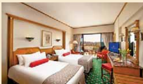
Sonesta St. George Hotel Luxor | Luxor (Rooms renovated in 2025 | Updated images coming soon)