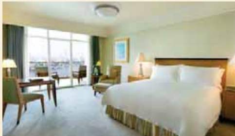
Four Seasons Hotel Cairo at Nile Plaza | Cairo