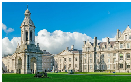
Trinity College, Dublin, Ireland