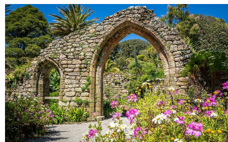
Abbey Ruins Flowers, Tresco, Isles of Scilly