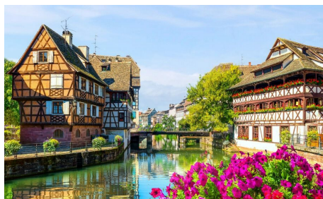
Timbered houses in Strasbourg, France

Embark on an exhilarating European adventure steeped in storied history, grand architecture and breathtaking scenery on this fabulous 12-day, 11-night itinerary. In Switzerland, discover unforgettable Montreux, hub of music and culture. Marvel at the beauty of Lake Geneva on a sightseeing cruise and the sweeping grandeur of the Alps during a panoramic train ride. Explore the picturesque towns of Gruyères and Basel. Then board the sumptuous Amadeus Queen, boasting luxurious amenities and impeccable service, to enjoy a deluxe 7-night river cruise. Soak up the timeless beauty of the Rhine and Moselle rivers as you wind past storybook towns, terraced vineyards and forested hills crowned by castles. After embarking in Breisach, Germany, call at Strasbourg, France; Heidelberg, Germany; Rudesheim; Cochem; Cologne and Amsterdam, Netherlands. Add to your amazing European exploration with an optional post-tour extension in Amsterdam.