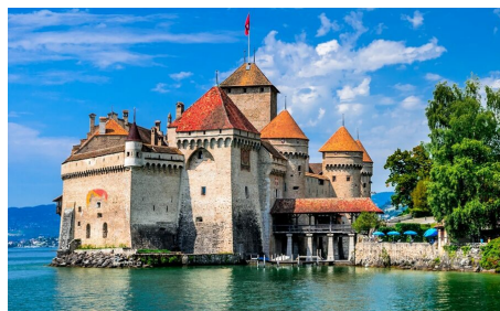
Château de Chillon, Lake Geneva, Switzerland