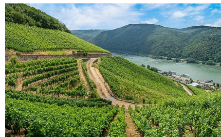
Rudesheim vineyards, Germany