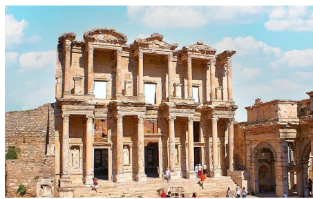
Facade of the Library of Celsus