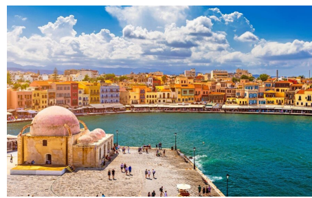
Old Venetian Harbor, Chania, Crete, Greece