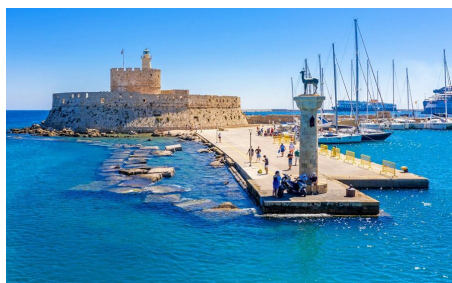
A stone fortress with a lighthouse, surrounded by sea, and a pier with a deer statue, people, and boats