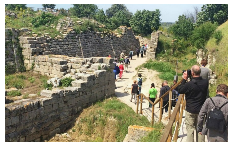
A group of people walking through an ancient stone ruins site with tall stone walls and greenery.