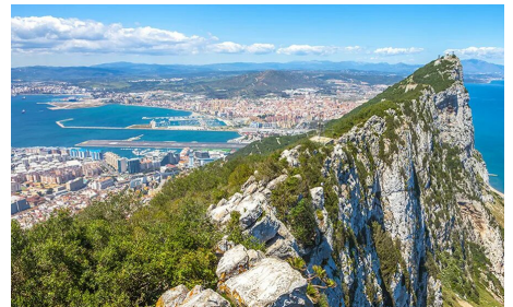
Rock of Gibraltar