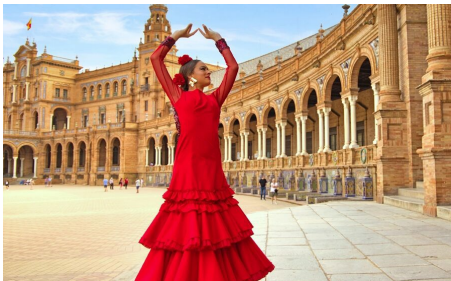
Seville flamenco dancer, Spain

Step aboard the exclusively chartered, deluxe World Voyager for an extraordinary eight-night cruise across two continents and four countries, following the storied trade routes that once connected Africa and Europe. Sail from Lisbon, Portugal, to Casablanca, Morocco, and explore some of the most historically rich and culturally vibrant cities along the Iberian Peninsula and the northeast African coast. Enjoy exciting excursions in storied port cities that once linked ancient empires in Portugal, Gibraltar, Spain and Morocco. Begin in Portugal to discover the maritime charm and ancient walls of Lagos and Portimão — both once vital hubs of Portuguese exploration. Continue to Seville, where you'll visit its majestic cathedral. In Gibraltar, stand atop the iconic Rock — known to the ancients as the Pillars of Hercules — encounter Barbary Apes, and explore the stunning St. Michael's Cave. Then stroll the vibrant souks of Tangier and uncover the layered history of Rabat before delving into Casablanca's breathtaking Hassan II Mosque, adorned with intricate Moroccan craftsmanship. Optional extensions in Marrakech and Lisbon add even more depth to this educational and cultural journey through time.