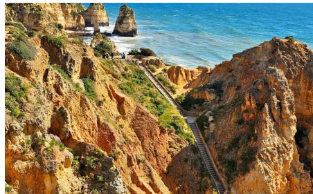
Ponta da Piedade in Lagos, Portugal