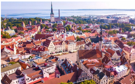
Aerial view of Tallinn, Estonia

Take advantage of a rare opportunity to explore six extraordinary Scandinavian and Baltic Sea countries on this culturally engaging itinerary. Cruise aboard the exclusively chartered, deluxe World Navigator and immerse yourself in ancient architecture, centuries-old history, storied landmarks, fascinating cities and breathtaking, romantic scenery. As you cruise the Baltic Sea, explore historic Helsingør and marvel at Copenhagen's iconic sites on a canal cruise. See the magnificent Neptune's Fountain in Gdansk and the iconic shipyard where Solidarity was born. Discover fascinating Klaipeda, Lithuania, with your choice of unique excursions. Tour Riga, brimming with 18th- and 19th-century Art Nouveau/Jugendstil architecture, and experience its solemn Jewish history. Discover Helsinki's Sibelius Park, an artistic homage to Finland's most famous composer, and the subterranean Tempelaukio Church, hewn from bedrock. Explore Tallinn's UNESCO World Heritage-designated Old Town, virtually unchanged for 600 years. Augment your program with the Norway Pre-Tour Extension and/or the Stockholm Post-Tour Extension.