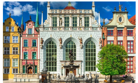
Artus Court in Gdansk Poland