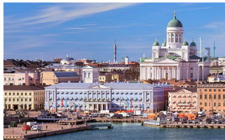
Finland Helsinki, Helsinki Cathedral, South Harbor