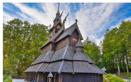
Fantoft Stave Church, Bergen, Norway