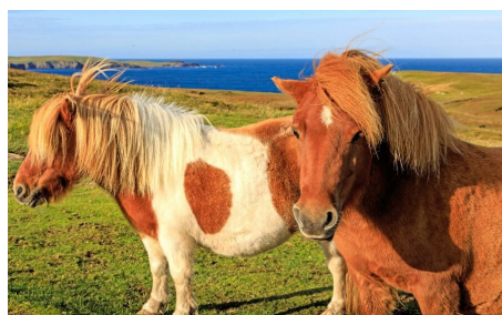
Shetland ponies, Shetland Islands, Scotland