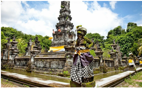
Jagatnatha Temple, Bali

On this incomparable adventure, discover the eclectic vibrance of Singapore, the extraordinary biodiversity of Borneo and the compelling cultural mosaic of Indonesia's spectacular archipelago. Begin by spending two nights in Singapore before boarding the deluxe small ship, Le Jacques Cartier, for a 9-night cruise. Wrap up with a two-night stay in Bali. In lush rainforests, witness an amazing array of wildlife, including endangered species. Enjoy a guided walking safari of UNESCO-designated Komodo National Park, home to the largest lizard on Earth, the Komodo dragon. Explore Borneo's unforgettable Tanjung Puting National Park from a river surrounded by tropical rainforest; look out for orangutans and proboscis monkeys in their natural habitat. Tour the bustling cities of Singapore and Denpasar, and small villages where you'll experience local culture, learn about batik, see acclaimed Balinese dancers and root for your favorites in a buffalo race!