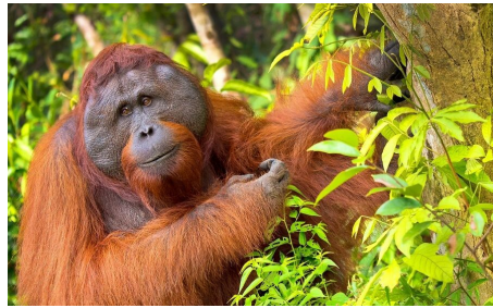
Orangutan in Tanjung Puting National Park, Borneo