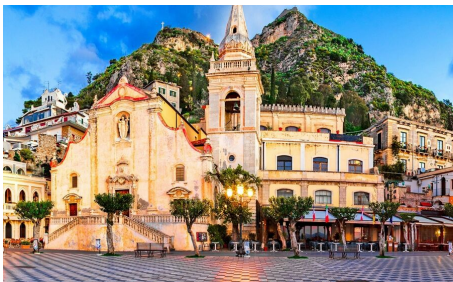
Taormina, Sicily, Italy

Grab a front-row seat to one of nature's most awe-inspiring spectacles — a total solar eclipse, experienced in the open sea where skies are wide and uninterrupted. This unforgettable 10-night voyage begins with one night in the Eternal City of Rome before boarding the exclusively chartered Wind Spirit, setting sail through the heart of the Mediterranean. Discover the charm and history of captivating destinations: Palermo, Trapani, Erice, Valletta, Gozo and Taormina. Traveler's Choice excursions allow you to choose enriching tours in Palermo, Trapani and Gozo, including culinary tours, beach time, historical and market adventures, and more. Plus, experience Valletta's baroque splendor and centuries of seafaring history and walk through time at Taormina's beautifully preserved Greek theater. Perhaps most inspiring will be experiencing a total solar eclipse, conditions permitting. Beneath the vast sky, witness the rare moment when the moon completely obscures the sun, casting an eerie twilight over the ocean. Throughout the journey, experts and cultural guides will offer fascinating insights. It's a once-in-a-lifetime celestial experience!