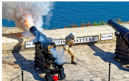
Fort Lascaris, Valletta, Malta