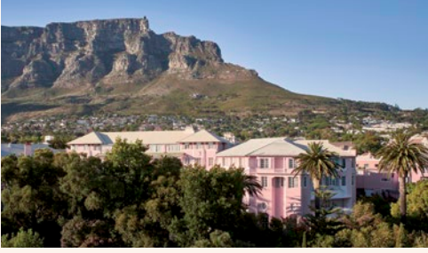
Mount Nelson, A Belmond Hotel | Cape Town