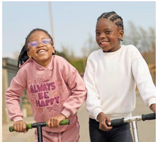
Youth program in Soweto