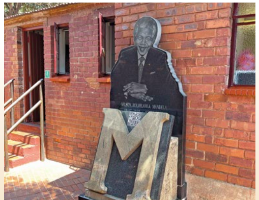
Nelson Mandela's house

Safari: Rise early for a sunrise safari at The Hide, a private concession in Hwange National