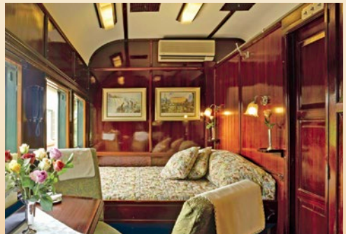
Deluxe Suite with a double bed and a lounge area

Discover the glamour of the Golden Age of train travel aboard the luxurious Rovos Rail. Ride in vintage carriages, restored to mint condition and impeccably appointed. Spend your days in the Observation Car or mingle with fellow travelers in the lounge. Expertly prepared cuisine showcases local ingredients and regional specialties, and all beverages are included. Each morning, take in the scenic splendor of the passing landscapes during a sumptuous breakfast. Three-course lunches and dinners, announced by a gong, include a selection of South African wines.