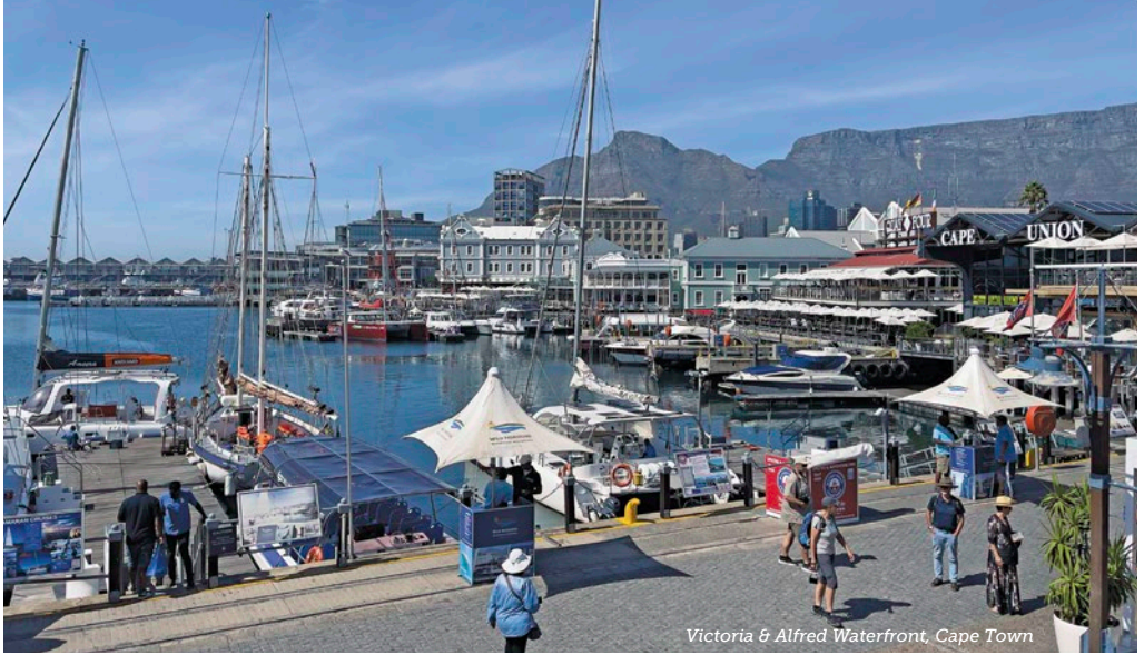
Victoria & Alfred Waterfront, Cape Town