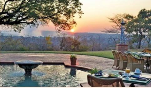
The Victoria Falls Hotel | Victoria Falls