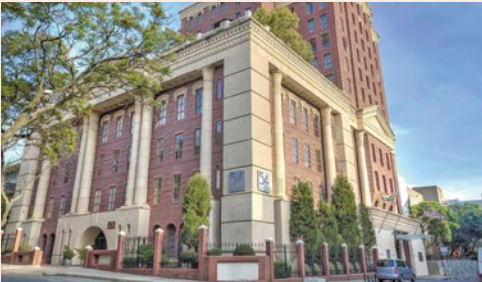
54 on Bath | Johannesburg