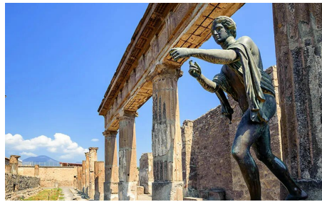
Bronze Apollo statue in Pompeii, Naples, Italy