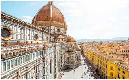
Top cityscape view on the dome of Santa Maria del Fiore church and old town in Florence

Embark on a captivating 7-night voyage from Rome to Naples aboard the elegant World Traveller, discovering the cultural riches and natural beauty of Italy, Corsica and the Amalfi Coast. This thoughtfully curated itinerary includes six unforgettable ports of call, each offering a window into history, art and Mediterranean charm. Begin in Tuscany with your choice of exploring the Renaissance splendor of Florence or the medieval allure of Lucca. Journey to Cinque Terre, where pastel-hued villages cling to dramatic cliffs and centuries-old cobblestone streets beckon a stroll. Sail to the French island of Corsica and discover Bonifacio, a striking citadel town perched above the sea. In Porto Cervo, Sardinia, choose between a scenic drive along the glamorous Costa Smeralda, a visit to a traditional Gallura winery or time to relax on pristine beaches. Return to mainland Italy to uncover the haunting ruins of Pompeii, frozen in time beneath volcanic ash. Conclude your voyage with a visit to the enchanting Amalfi Coast, where sun-drenched vineyards, fragrant lemon groves and sweeping sea views await. This immersive journey promises not only breathtaking landscapes but also enriching experiences that bring the region's history and culture to life. Choose to extend your journey with our Pre-Extension in Rome or Post-Extension in Naples!