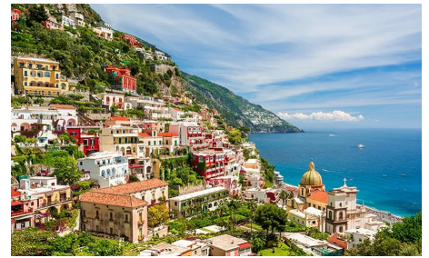
Amalfi Coast, Positano, Italy