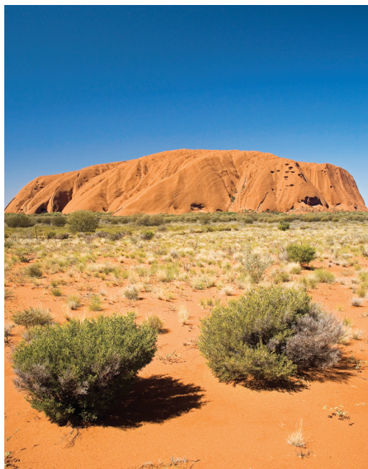
Aboriginal site of Uluru (Ayers Rock)

Day 22: Depart for U.S. This afternoon we transfer to the Auckland airport for our flights to the U.S., where we connect with our return flights home. B